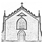
Holy Family Clostoken