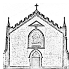
Holy Family Clostoken